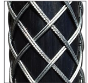
(2-layered / standard)