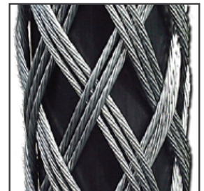
(3-layered / enhanced)